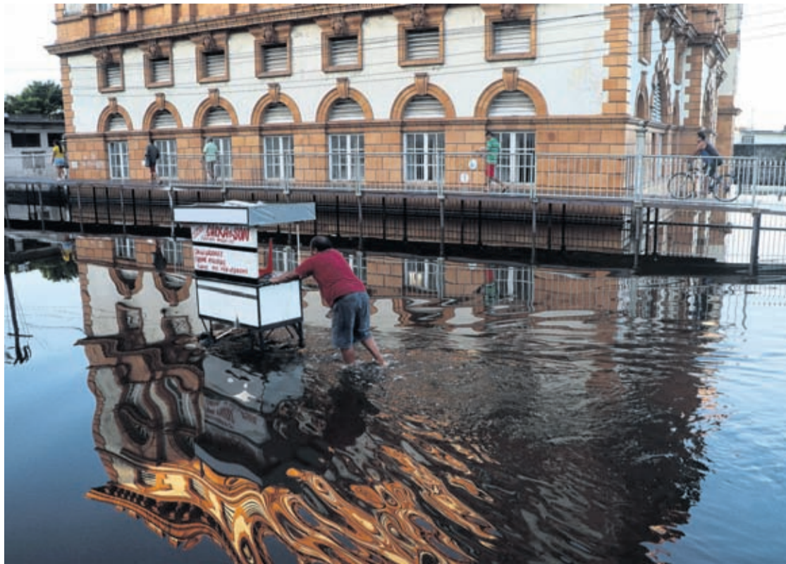
A street vendor pushes his mobile stall through a street flooded by the Negro River, in downtown Manaus, Amazonas state, Brazil, Tuesday, June 1, 2021.

Higher-than-usual precipitation is associated with the La Nina phenomenon, when currents in the central and eastern Pacific Ocean affect global climate patterns. Environmental experts and organizations